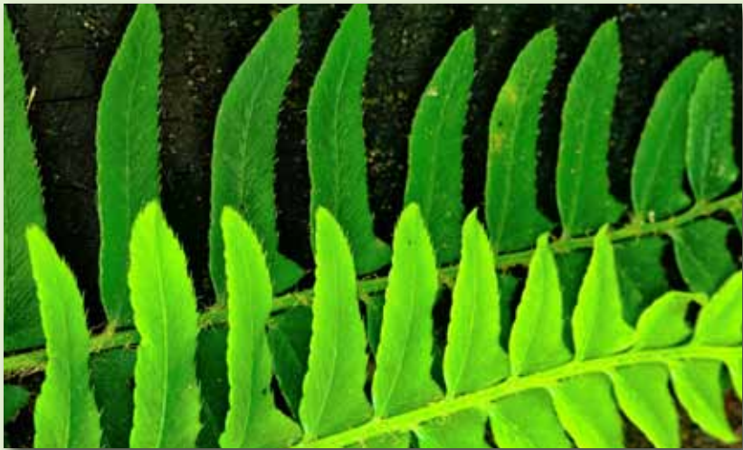
▲ Ferns at the Timberland Swamp Nature Sanctuary.

The purpose of the Michigan Nature Association is to acquire, protect and maintain natural areas that contain examples of Michigan endangered and threatened flora, fauna and other components of the natural environment, including habitat for fish, wildlife and plants of the state of Michigan and to carry on a program of natural history study and conservation education.