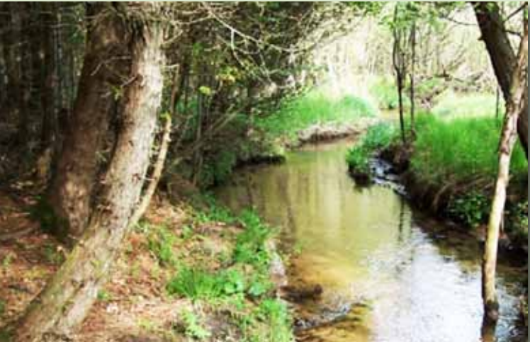
▲ Bender Creek flows through the Genevieve Casey Nature Sanctuary, part of the 2011 addition to the sanctuary.