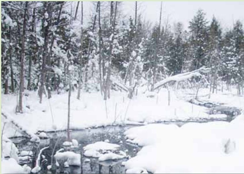
▲ A snowy scene from the Green River Nature Sanctuary.

We would like to thank the Michigan Department of Natural Resources, the U.S. Fish and Wildlife Service, the J.A. Woollam Foundation, The Nature Conservancy, the Consumers Energy Foundation, the Leuthold Foundation, REI, Inc., and our other partners for their assistance in 2011.