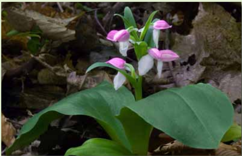
▲ A showy orchis at a nature sanctuary in southwestern Michigan.

MNA is very appreciative of the contributions of each and every member, donor and volunteer. We made every attempt to be accurate in our list, which includes donations made between March 1, 2010 and October 31, 2011; any name not included was done so unintentionally and we apologize for the omission.