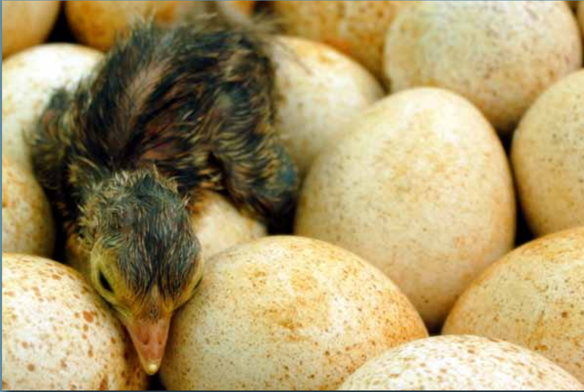
A photo of a hatchling on a nest taken at Jasper Woods Nature Sanctuary.