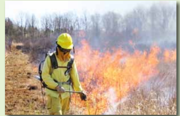
▲ A member of the MNA burn crew lighting a prescribed burn of a nature sanctuary.

Secured funding from a WHIP grant to generate and implement a future plan to control invasive species at the sanctuary in Lenawee County