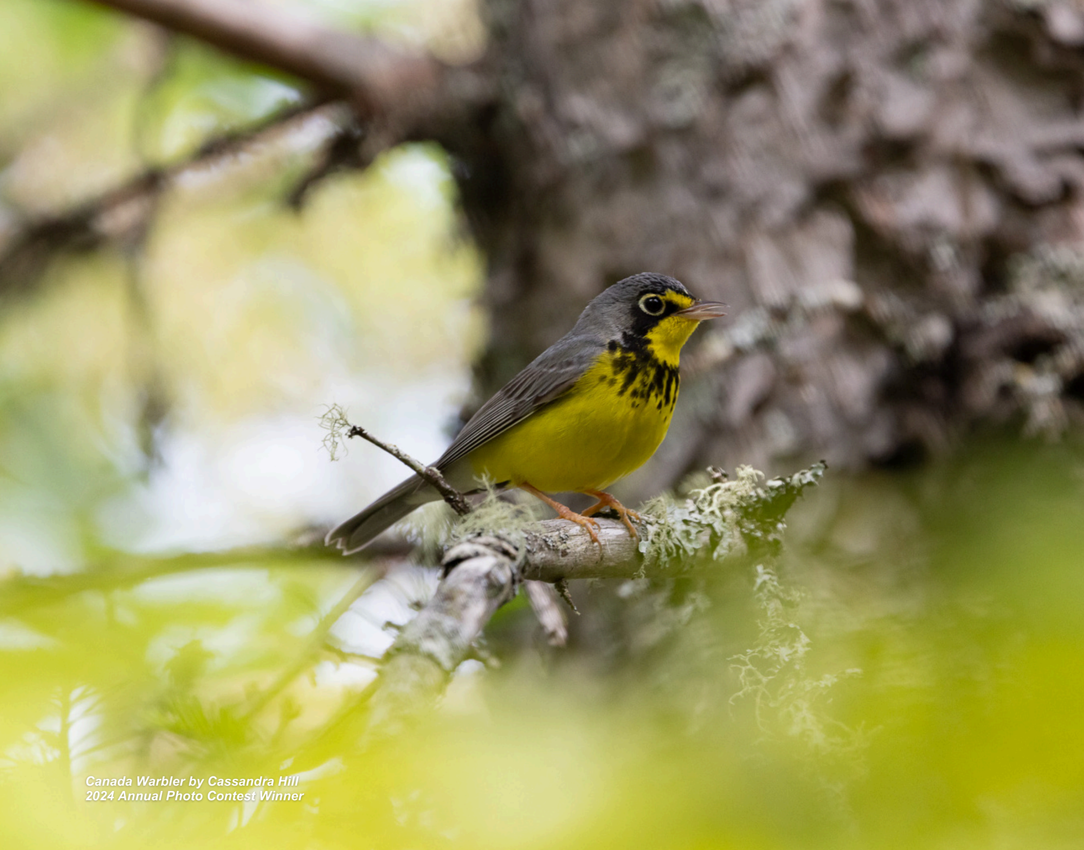
Canada Warbler by Cassandra Hill 2024 Annual Photo Contest Winner