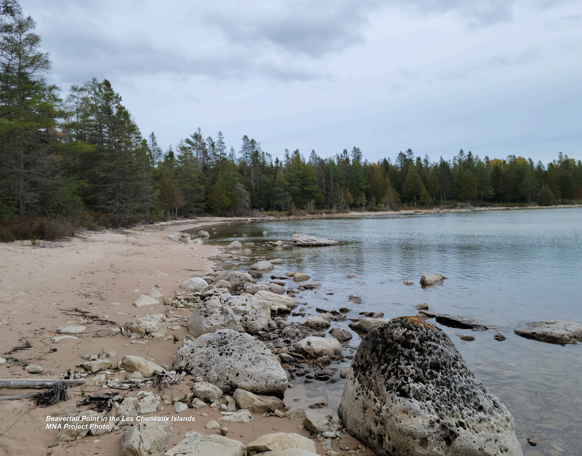
Beavertail Point in the Les Cheneaux Islands