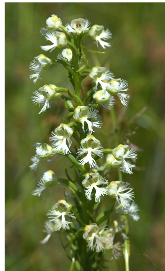
Prairie Fringed Orchid (Platanthera praeclara).