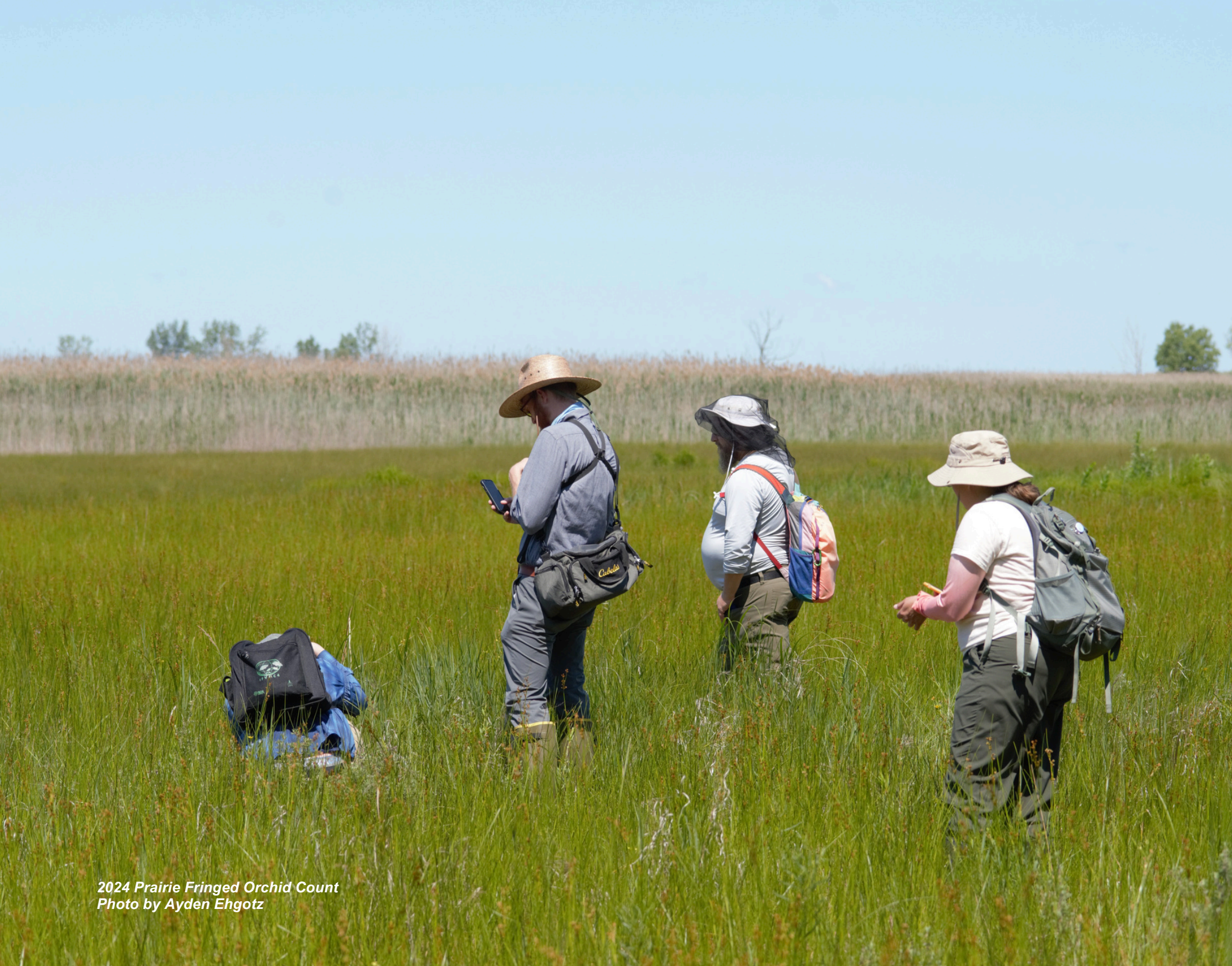
2024 Prairie Fringed Orchid Count