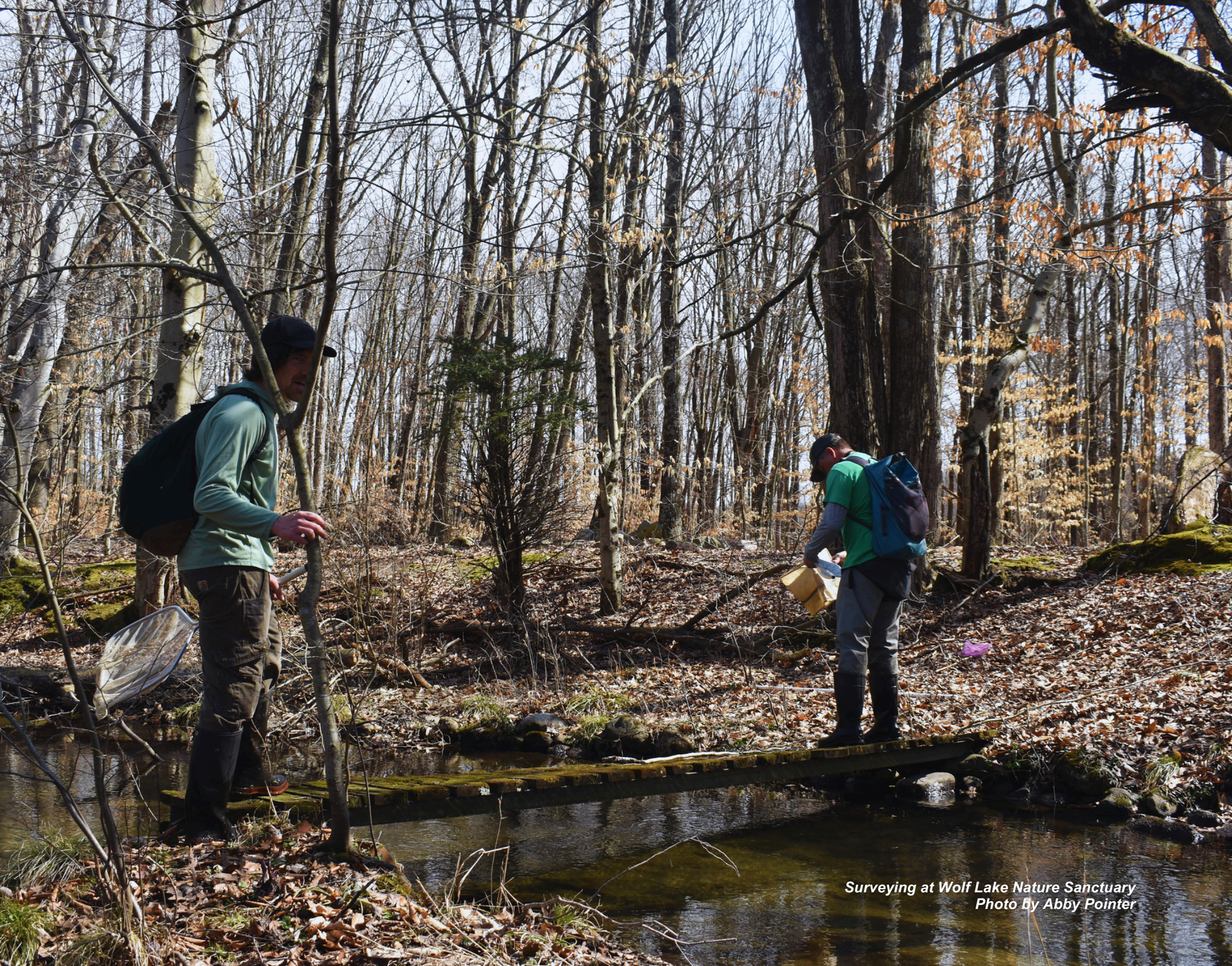
Surveying at Wolf Lake Nature Sanctuary