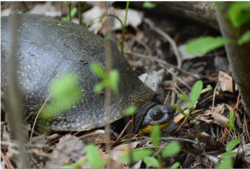
Blanding's Turtle (Emydoidea blandingii).

Work with your IRA administrator to arrange your gift or reach out to MNA discuss your plans and how your legacy will benefit Michigan's environment.