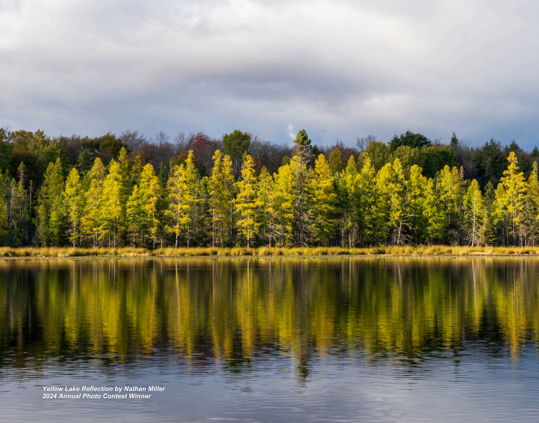
Yellow Lake Reflection by Nathan Miller 2024 Annual Photo Contest Winner