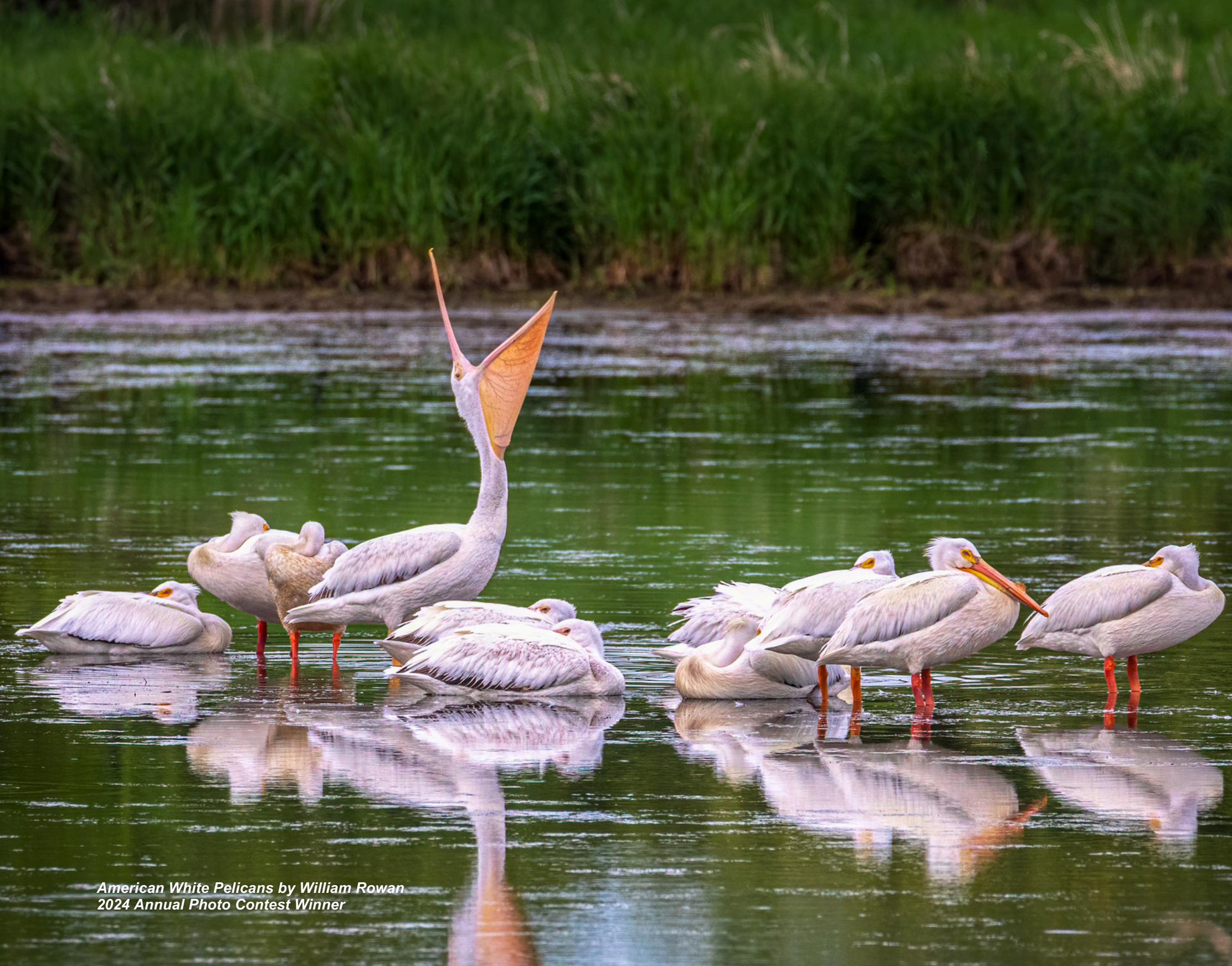
American White Pelicans by William Rowan 2024 Annual Photo Contest Winner