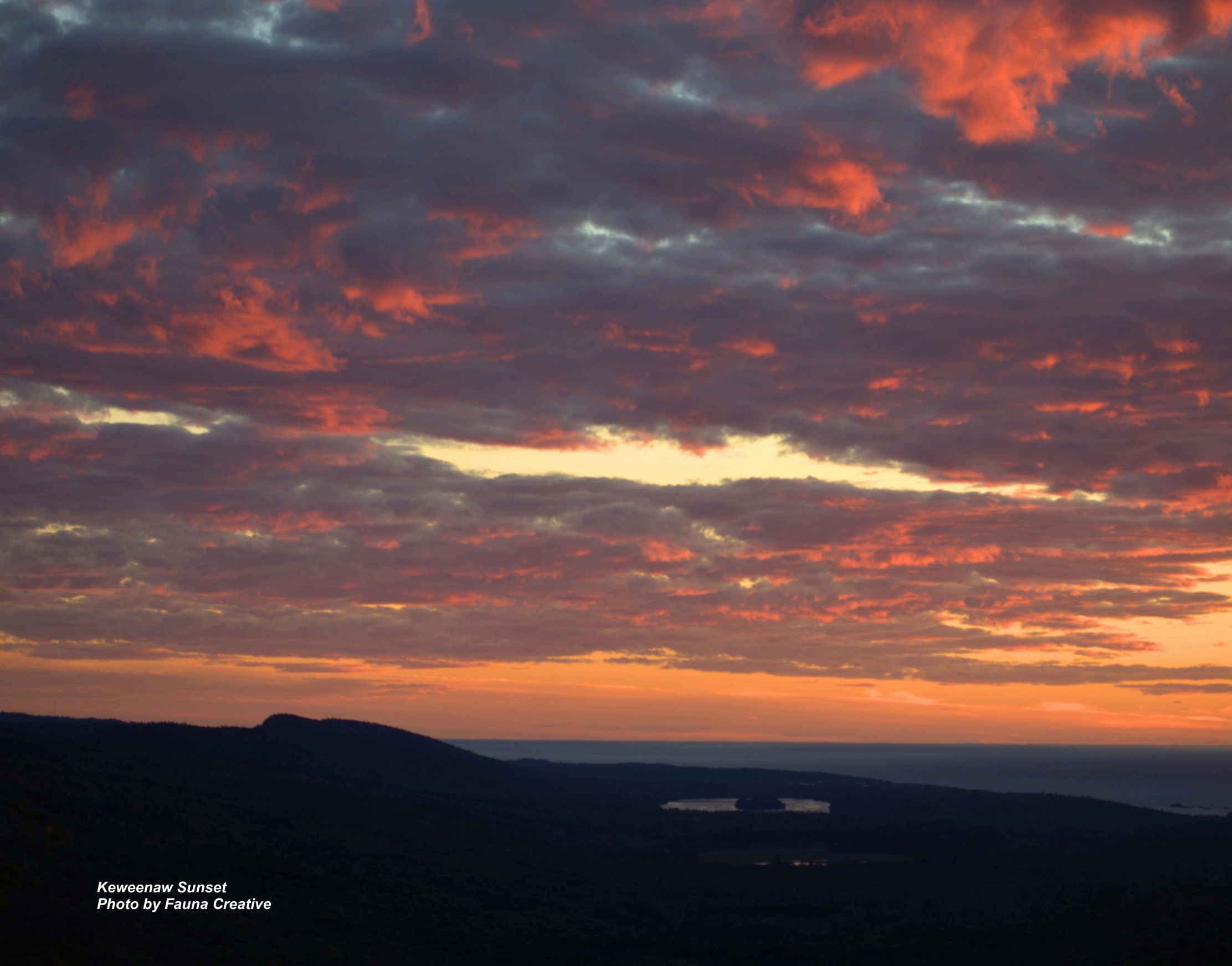
Keweenaw Sunset