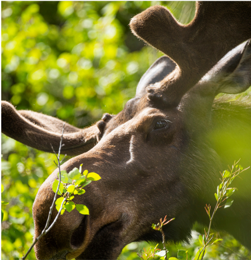
Moose ( Alces alces ).