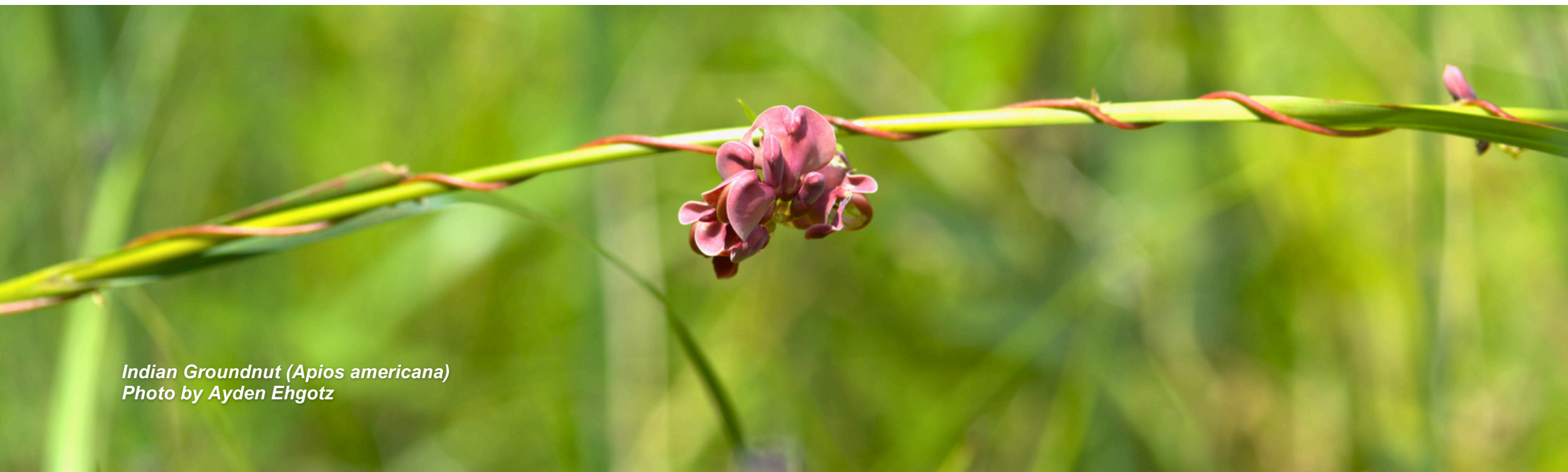
Indian Groundnut (Apios americana)

NON-PROFIT ORG US POSTAGE PAID LANSING, MI PERMIT #689