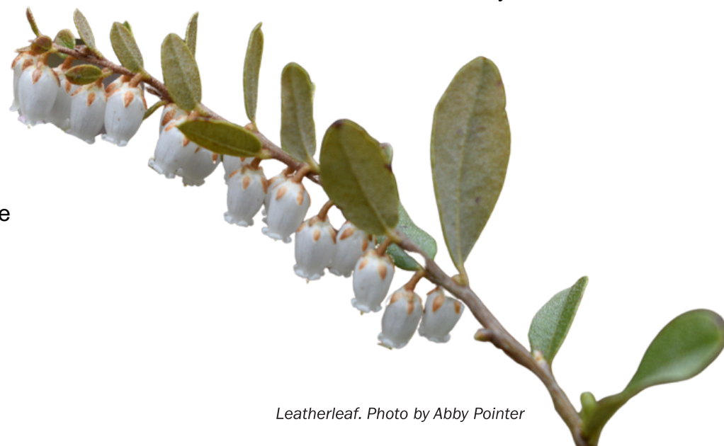
Leatherleaf.