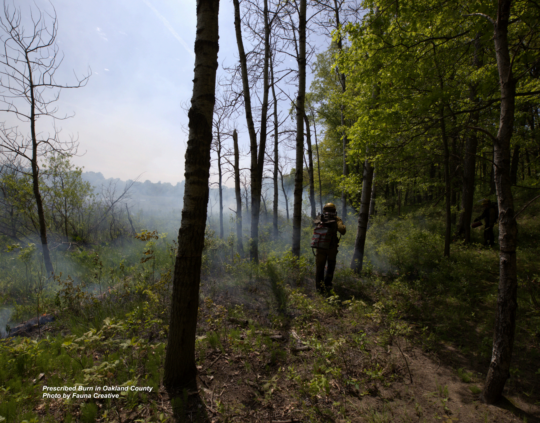
Prescribed Burn in Oakland County