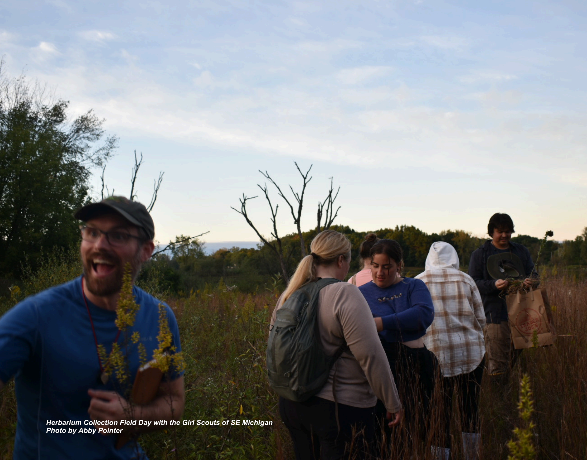
Herbarium Collection Field Day with the Girl Scouts of SE Michigan