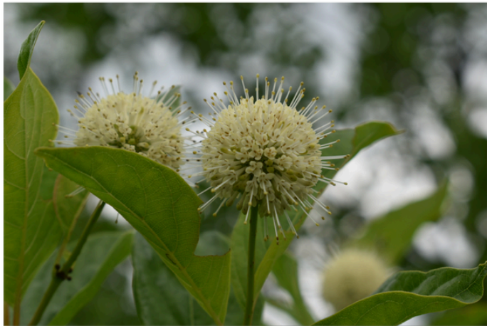
Buttonbush ( Cephalanthus occidentalis).

We are so grateful to the thousands of individuals and families who believe in and support MNA. Their commitment results in the accomplishments described in this Year in Review, as well as so many more over our 70-year history. MNA's inspiring story, long history, and incredible track record of success are remarkable and only possible because of our donors and volunteers—we thank them all for their inspiring contributions to conservation in Michigan through their support of MNA. MNA is very appreciative of the contributions by each and every member, donor, and volunteer. We have made every attempt to be accurate in our donor list, which includes donations made in the fiscal year between October 1, 2023 and September 30, 2024; any name not included was done so unintentionally and we apologize for the omission.