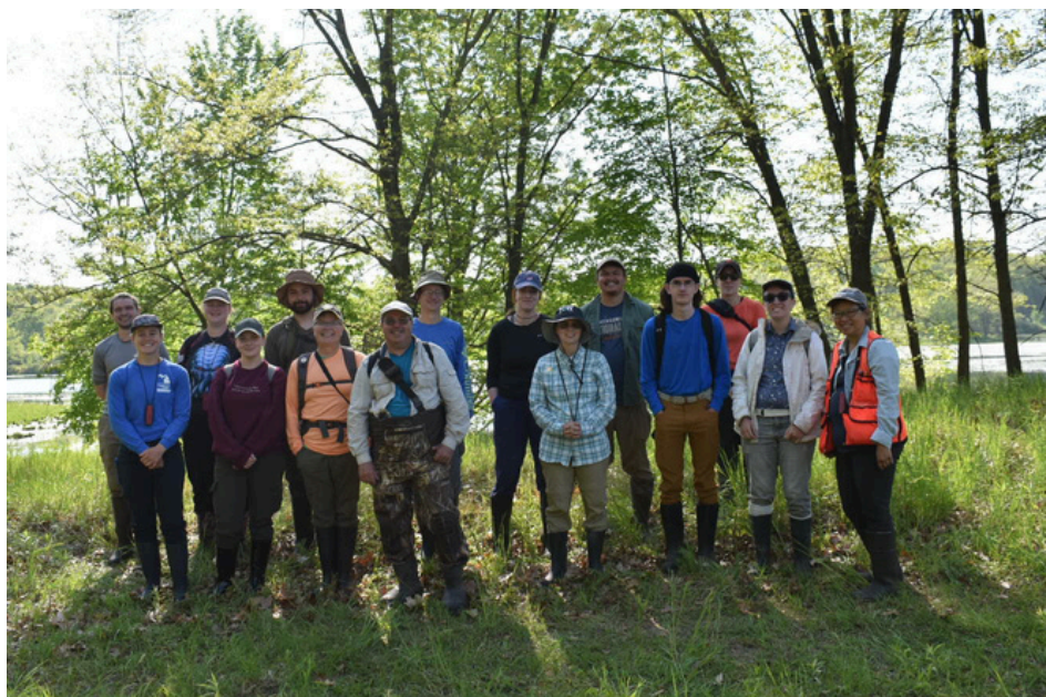
Volunteer Crew for 2024 Eastern Massasauga Rattlesnake Bioblitz

The purpose of MNA is to acquire, protect, and maintain natural areas that contain examples of Michigan's endangered and threatened flora, fauna, and other components of the natural environment, including habitat for fish, wildlife, and plants of the state of Michigan and to carry on a program of natural history study and conservation education. We envision a future where Michigan's rare, threatened, and endangered species, and imperiled natural communities thrive, and where they are valued by people and communities that embrace and benefit from Michigan's natural heritage.