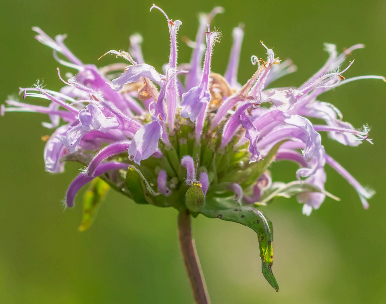
Bumblebee Leaving Beebalm Overall Winner of 2024 Photo Contest